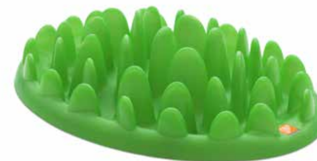
Mini & Regular